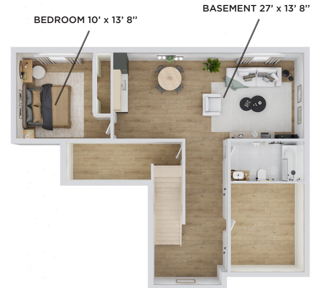
Photo and elevation may be shown with options. Options are subject to change without notice. Square footage and dimensions are approximate.