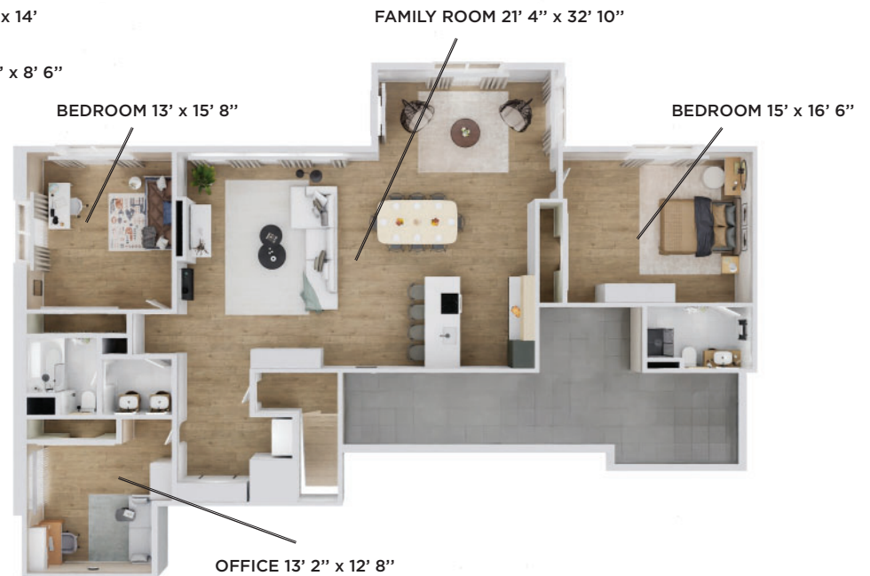
Photo and elevation may be shown with options. Options are subject to change without notice. Square footage and dimensions are approximate.